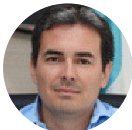
Martín Cerdá Minister of Hydrocarbons Government of Chubut