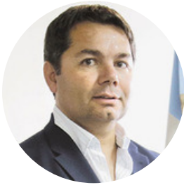
Alejandro Monteiro Minister of Energy and Natural Resources Government of Neuquen